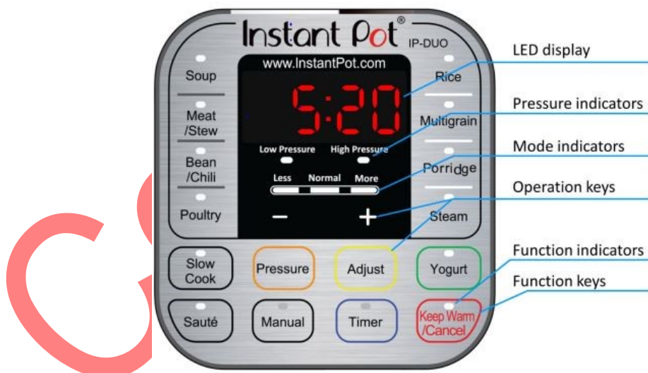
Figure 2 Control panel